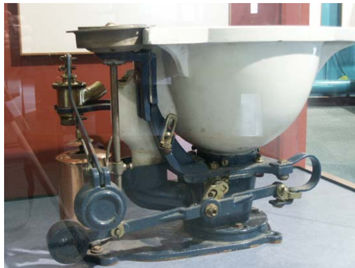
The hinged valve closet on display at Gladstone Pottery Museum, Stoke-on-Trent.

Thousands were sold. Every grand English country house simply had to have one and both engineers and potters were able to make a living constructing the clever device.