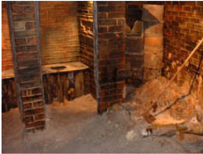
A privy at Gladstone Pottery Museum, Stoke-on-Trent.

So most people still relied on the humble privy; a plank and a bucket in a draughty hovel at the bottom of the garden.