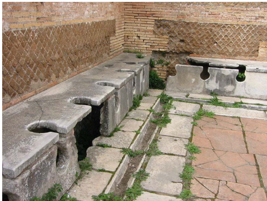
Roma Latrines, Ostia, Rome

The Romans were excellent sanitarians. They regarded ablutions as extremely important and built elaborate latrines in their towns and forts.