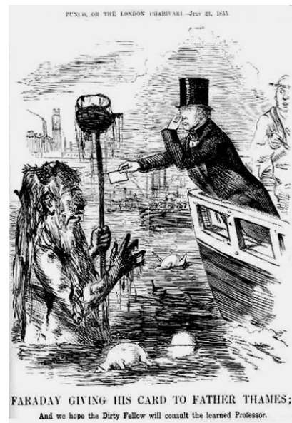
The Great Stink from a Punch Cartoon

What was needed was a freestanding, ceramic affair which required no mechanism and was relatively cheap. Many designs were produced and the bathroom industry was born.