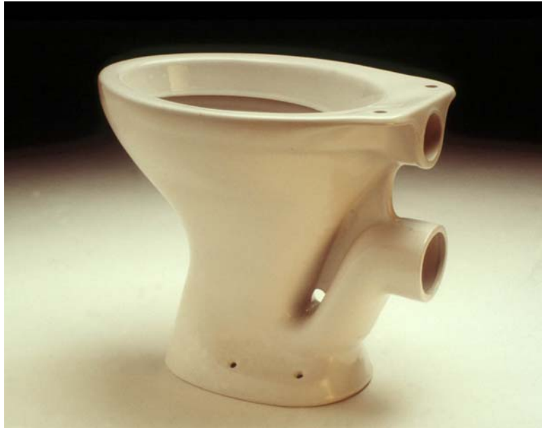
The British Standard WC

A very brief, entertaining, and very English perspective on the history of the toilet